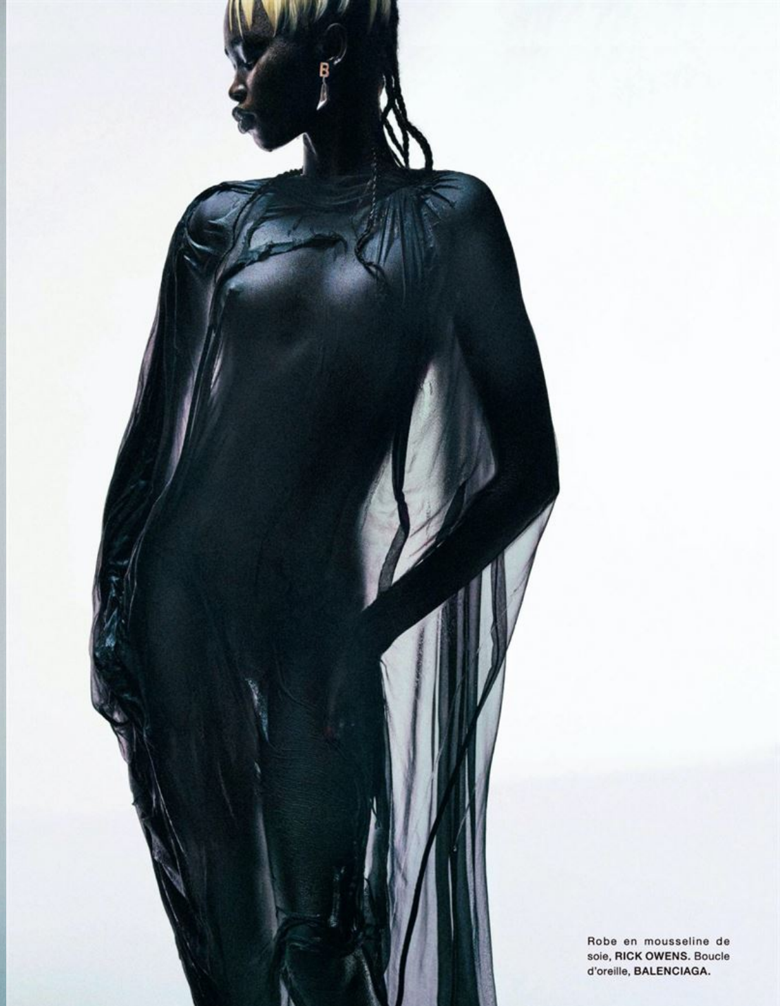
Robe en mousseline de soie, RICK OWENS. Boucle d'oreille, BALENCIAGA.