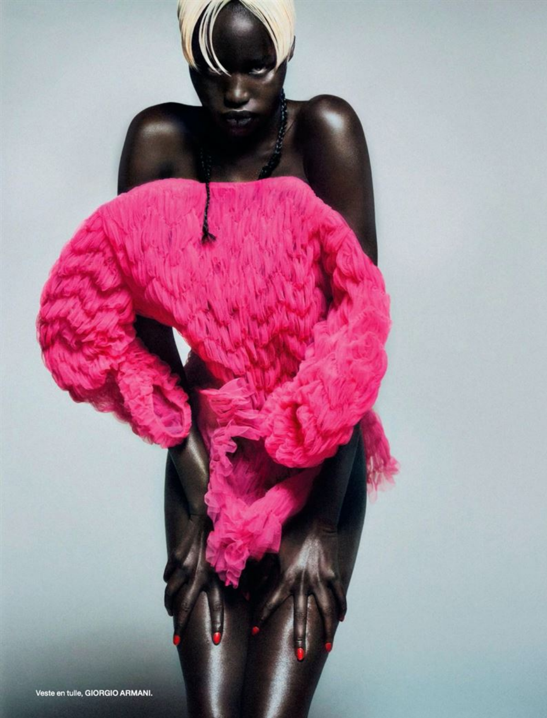
Veste en tulle, GIORGIO ARMANI.