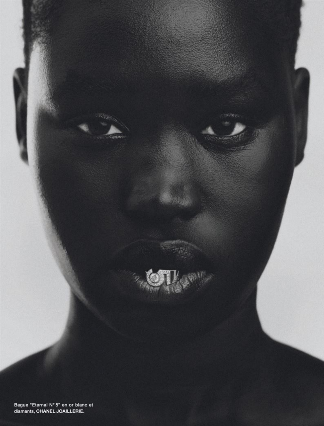
Bague "Eternal N° 5" en or blanc et diamants, CHANEL JOAILLERIE.