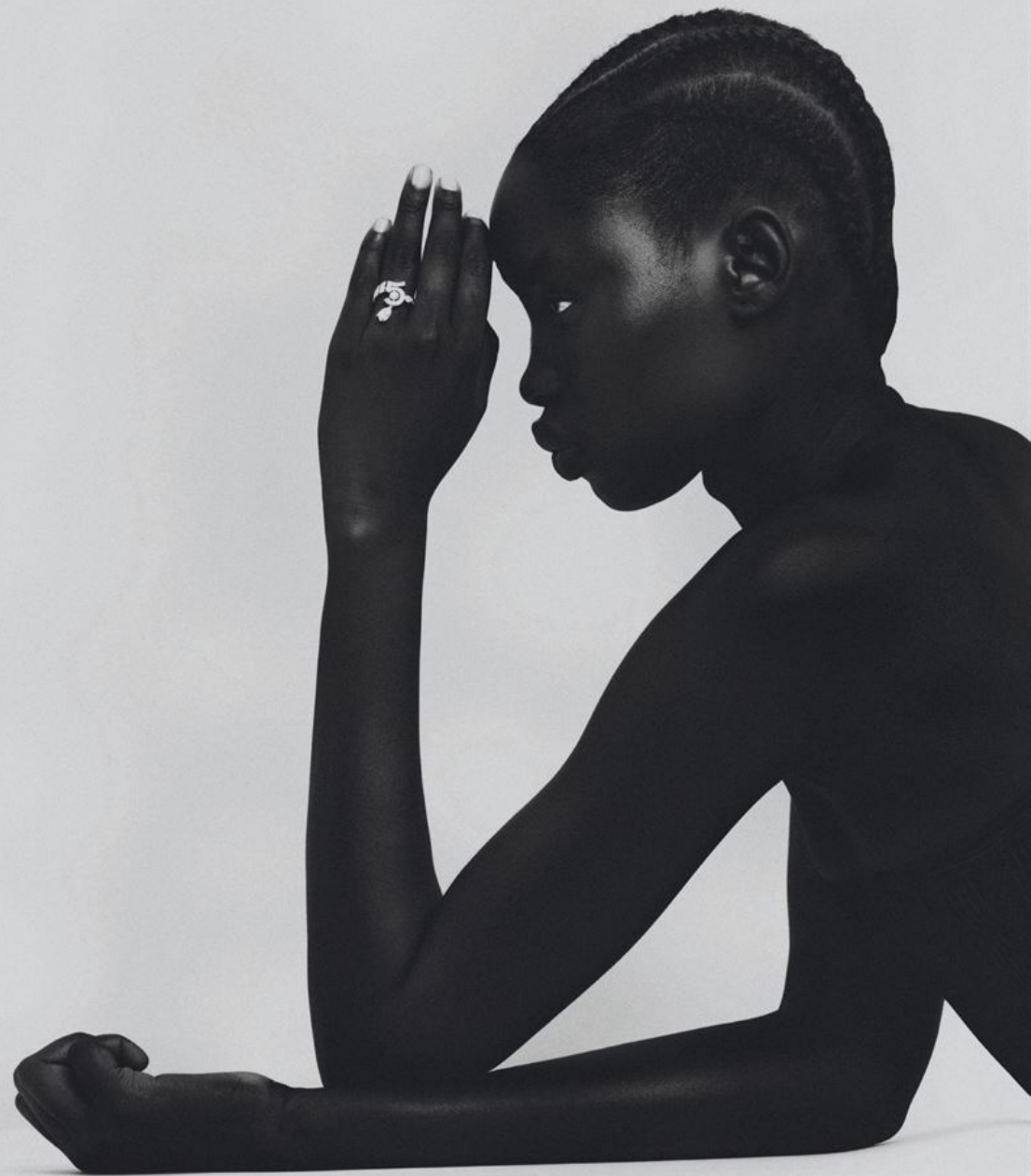
Bague "N° 5 Drop" en or blanc et diamants, CHANEL HAUTE JOAILLERIE.