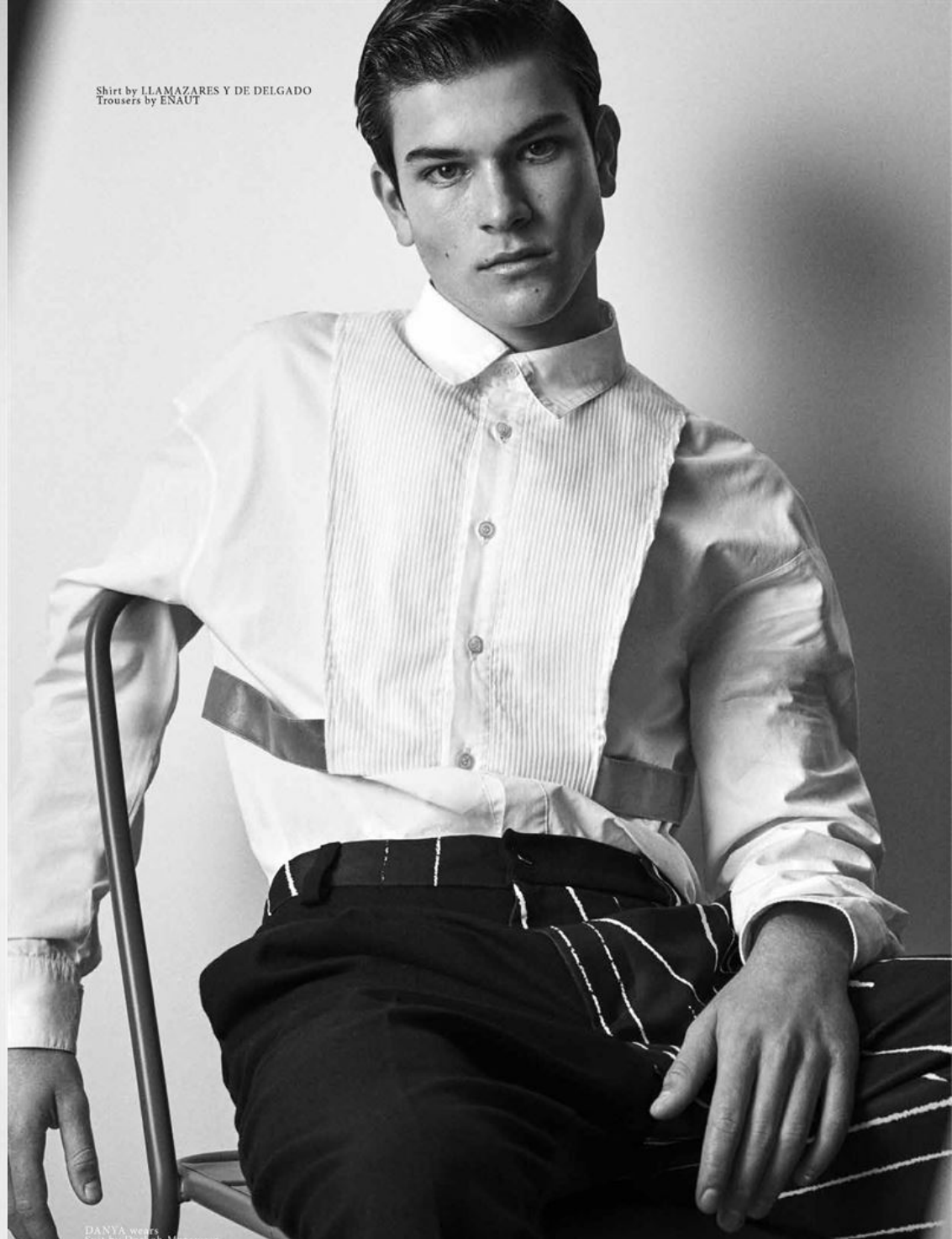
Shirt by LLAMAZARES Y DE DELGADO Trousers by ENAUT