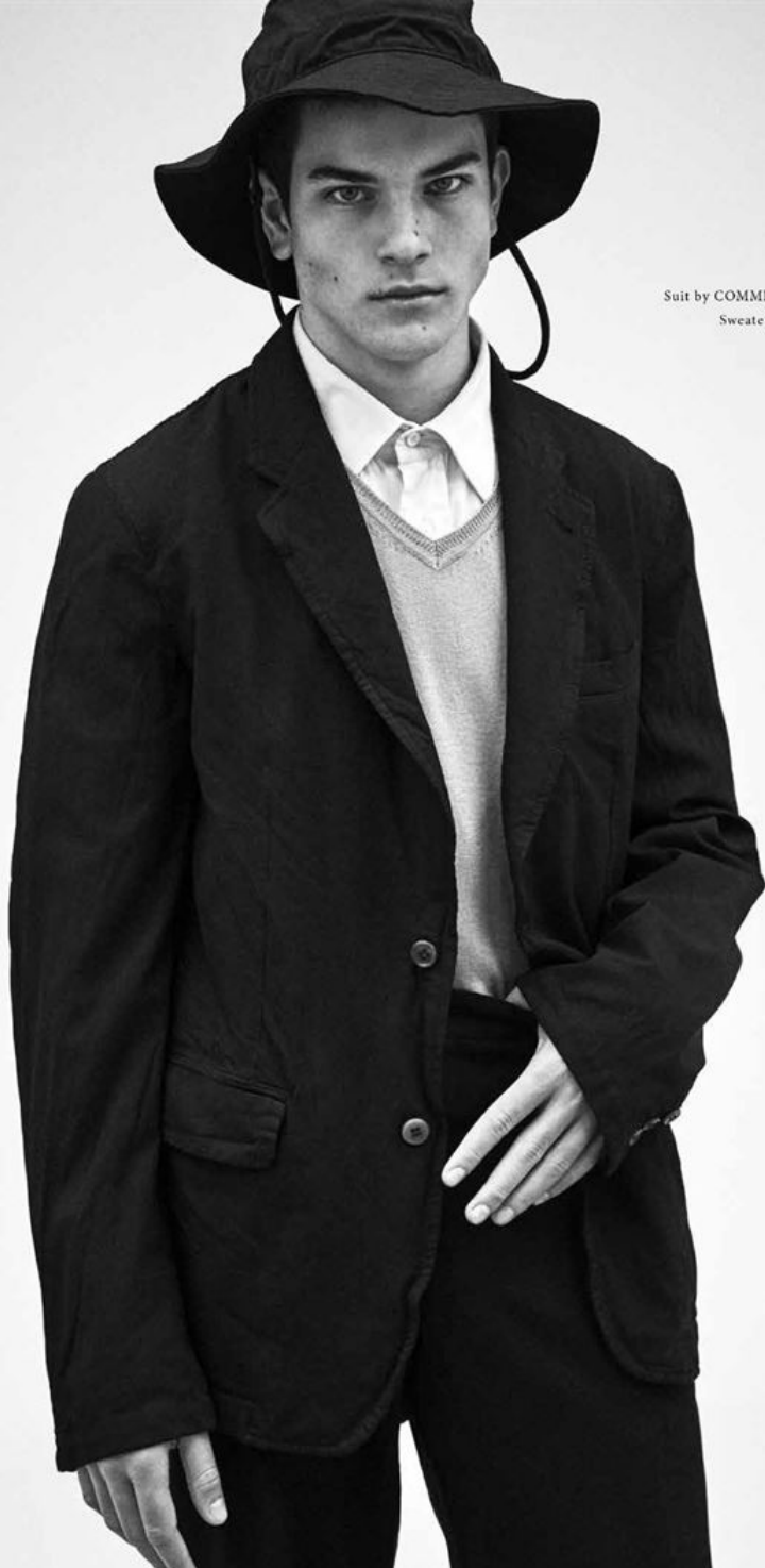
Suit by COMME DES GARCONS Shirt by PRADA Sweater by SLAZENGER Hat by ZARA