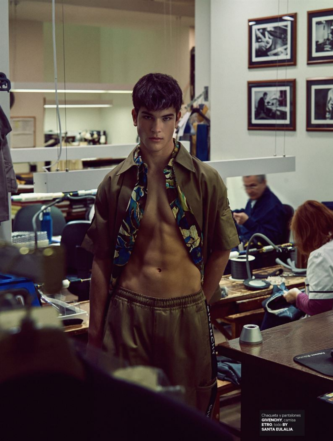
Chaqueta y pantalones GIVENCHY , camisa ETRO , todo BY SANTA EULALIA