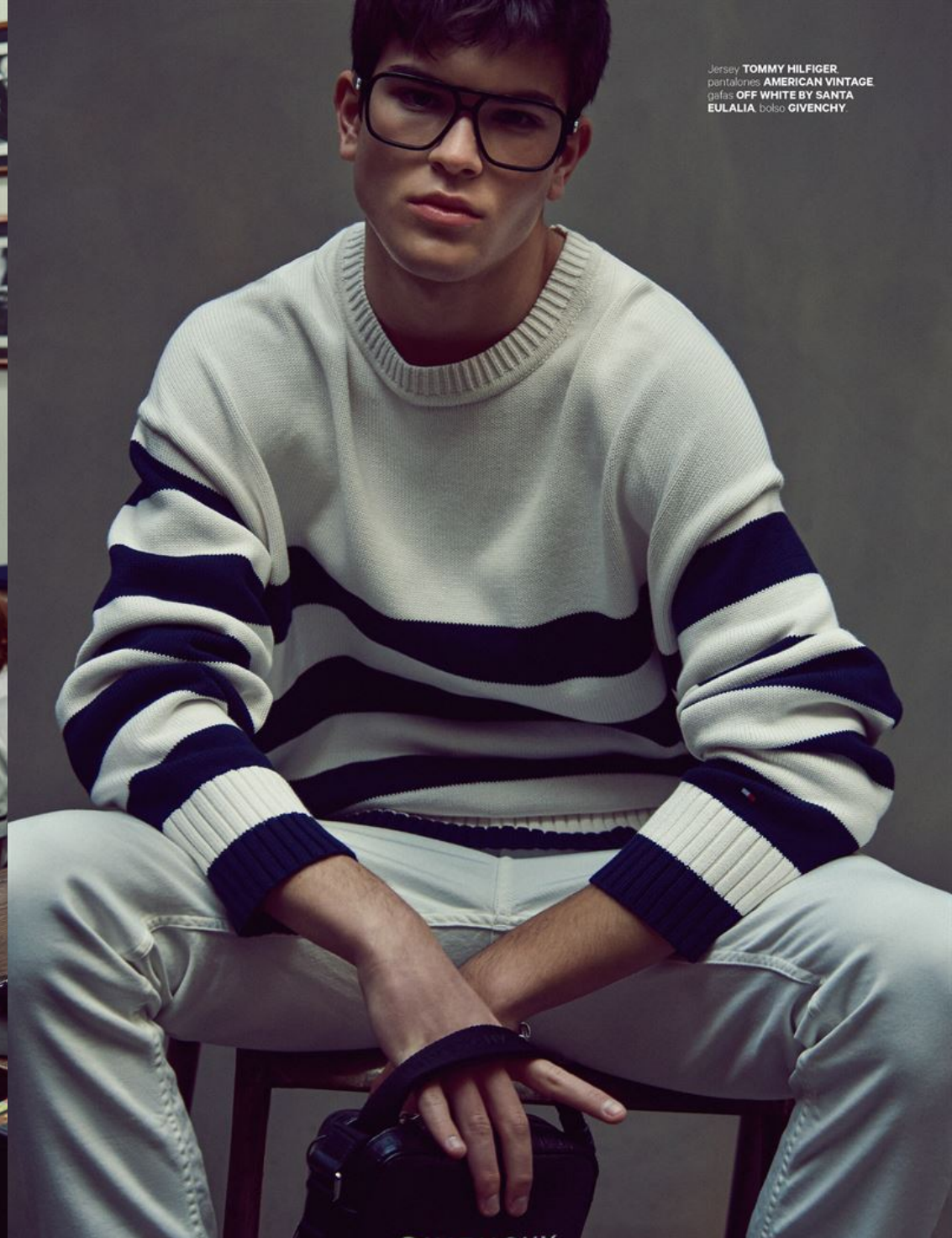
Jersey TOMMY HILFICER pantalones AMERICAN VINTAGE gafas OFF WHITE BY SANTA EULALIA , bolso GIVENCHY