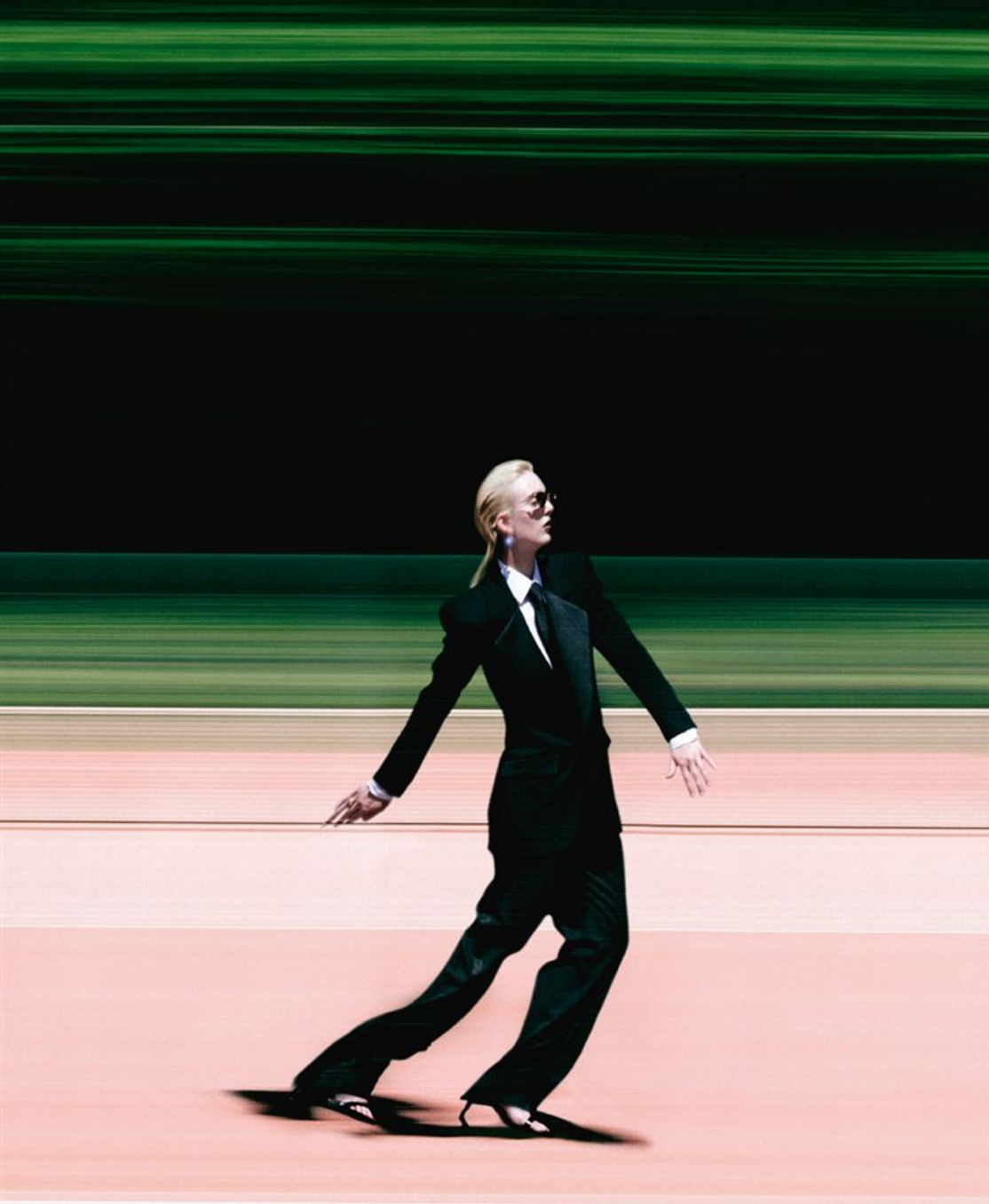
From left: Manyon wears leather coat PRADA, cotton shirt and tie CHARVET, cotton socks FALKE, (top to bottom) metal, resin and strass earring CHANEL, metal and crystal earring and crystal lace-up shoes DOLCE & GABBANA, sequin-embroidered tweed bag GUESS. Belle wears wool and silk blazer and wool trousers SAINT LAURENT BY ANTHONY VACCARELLO, cotton shirt and tie CHARVET, metal sunglasses BOTTEGA VENETA, gold-plated silver and diamond earring PANCONESI, gold and diamond ring EERA, patent leather sandals DOLCE & GABBANA