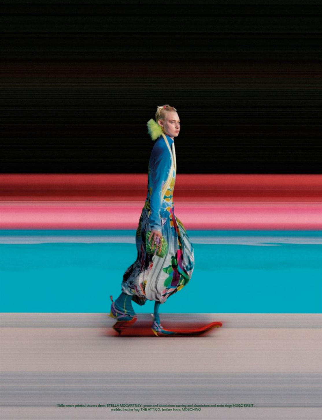
Belle wears printed viscose dress STELLA MCCARTNEY, goose and aluminium earring and aluminium and resin rings HUGO KREIT, studded leather bag THE ATTICO, leather boots MOSCHINO