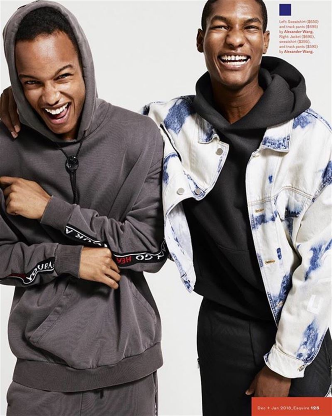
Left: Sweatshirt ($600) and track pants ($495) by Alexander Wang. Right: Jacket ($695), sweatshirt ($395), and track pants ($595) by Alexander Wang.