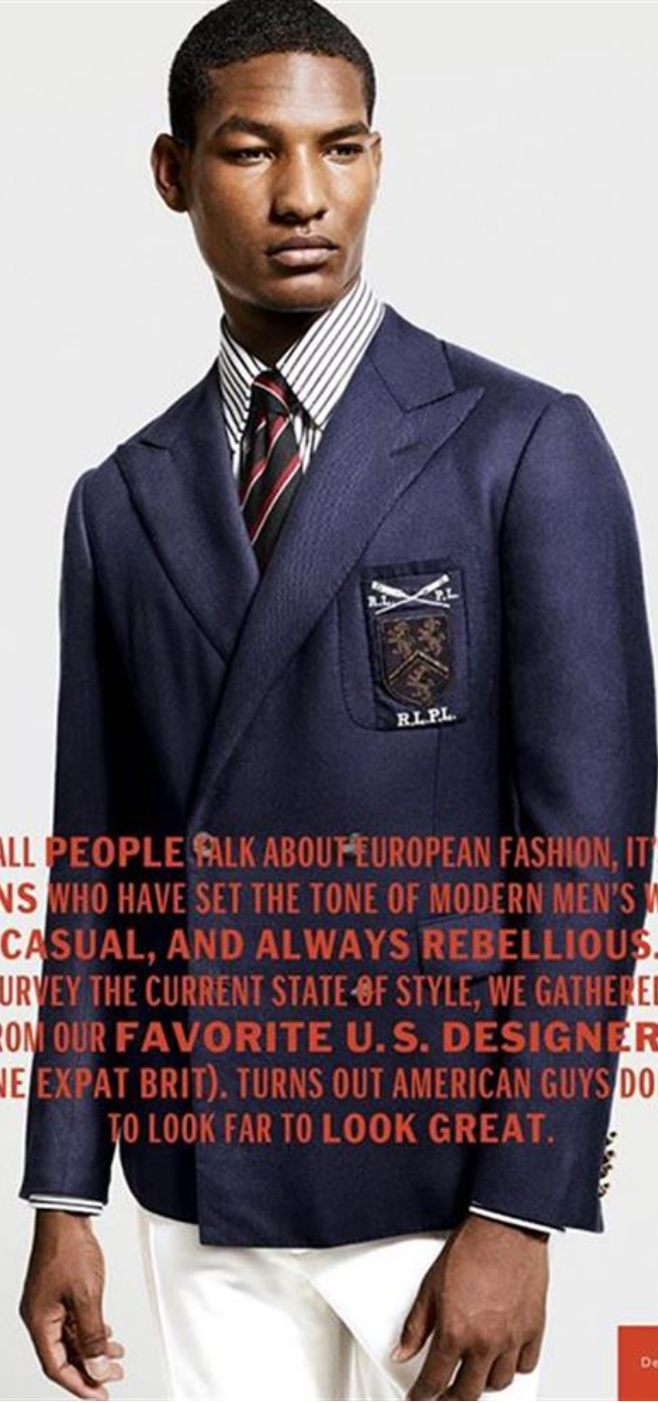
Jacket ($4,995), shirt ($450), trousers ($695), and tie ($235) by Ralph Lauren.