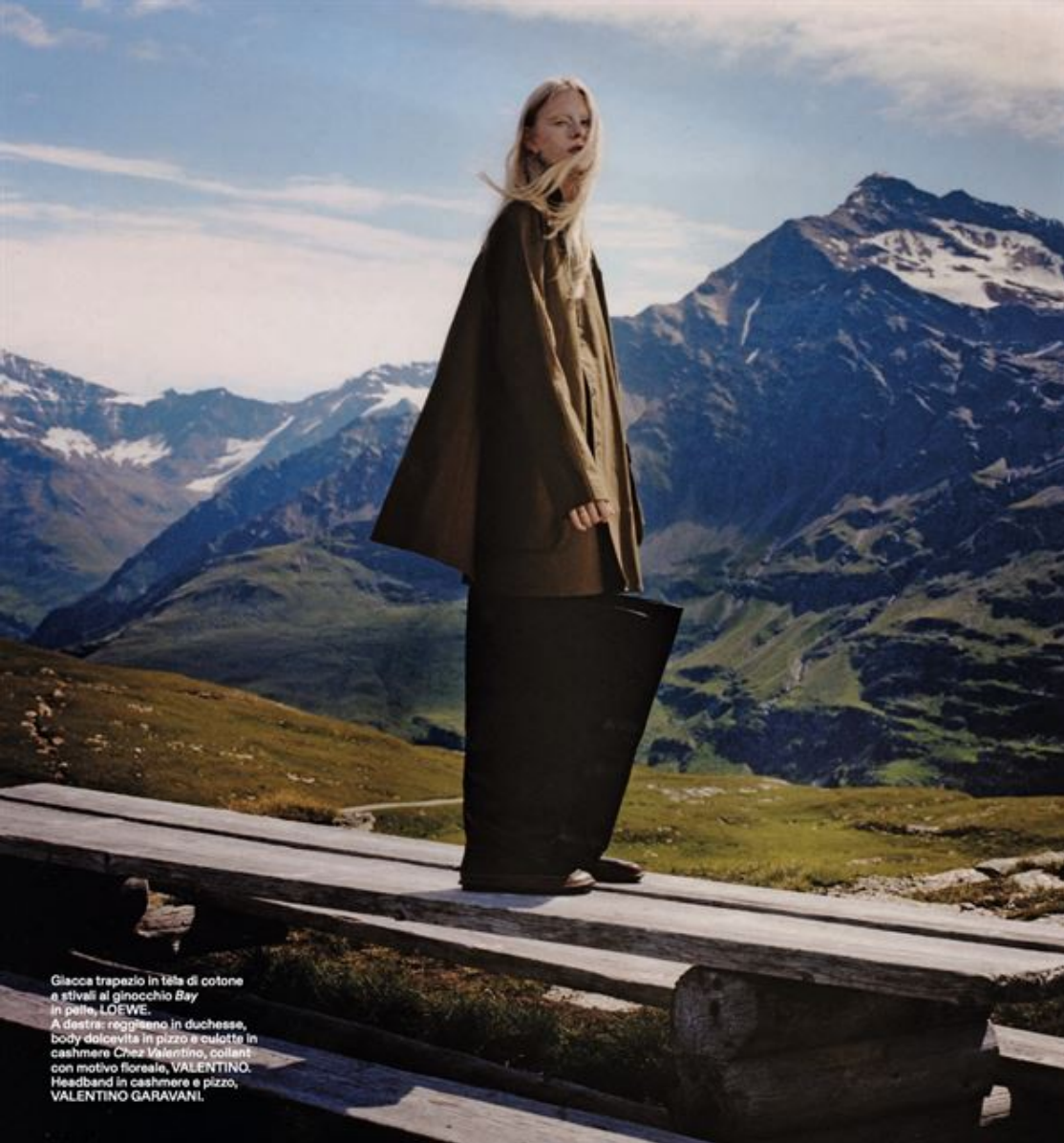
Giacca trapezio in tela di cotone e stivali al ginocchio Bay in pelle, LOEWE. A destra: reggiano in duchesse, body dolcevita in pizzo e culotte in cashmere Chez Valentino, collant con motivo floreale, VALENTINO. Headband in cashmere e pizzo, VALENTINO GARAVANI.