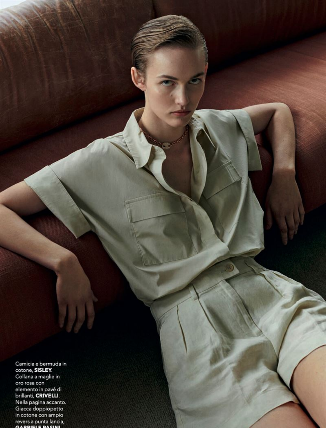
Camicia e bermuda in cotone, SISLEY . Collana a maglie in oro rosa con elemento in pavé di brillanti, CRIVELLI . Nella pagina accanto. Giacca doppiopetto in cotone con ampio revers a punta lancia, GABRIELE PASINI .