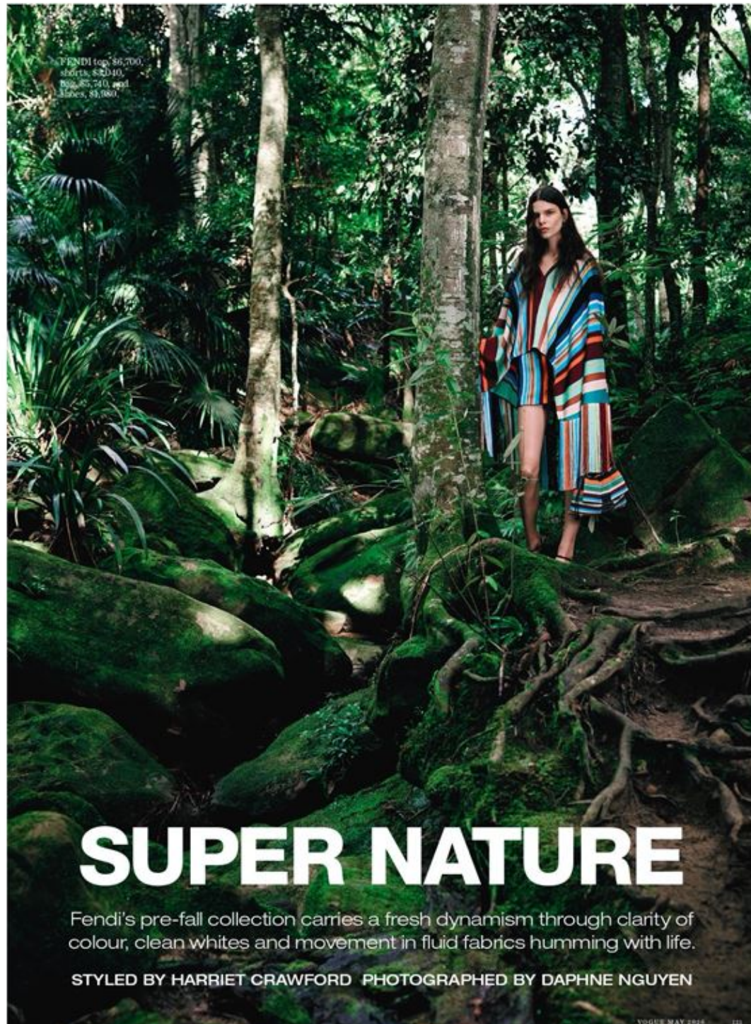
FENDI top, $6,700, shorts, $2,410, bag, $5,740, and shoes, $1,080.