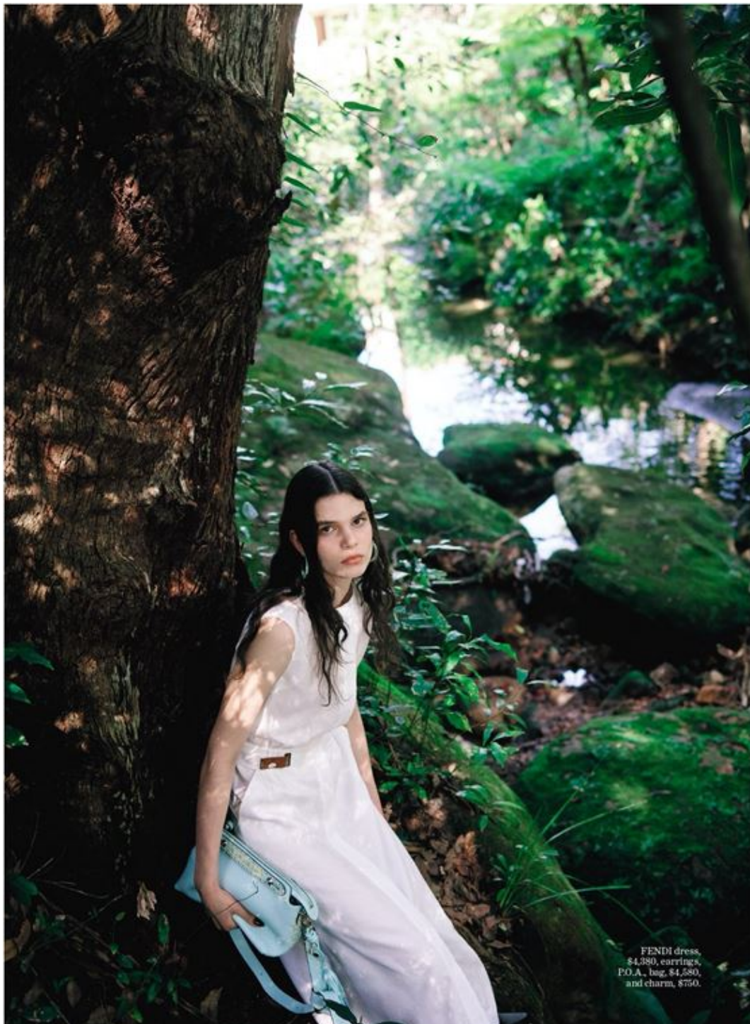
FENDI dress, $4,380, earrings, P.O.A., bag, $4,580, and charm, $750.