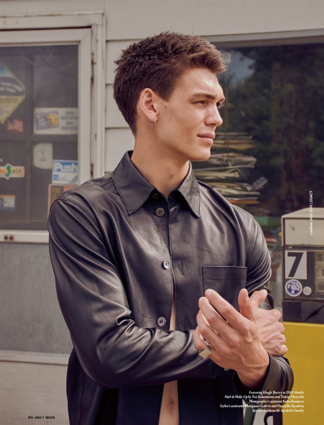
Leather shirt OUR LEGACY