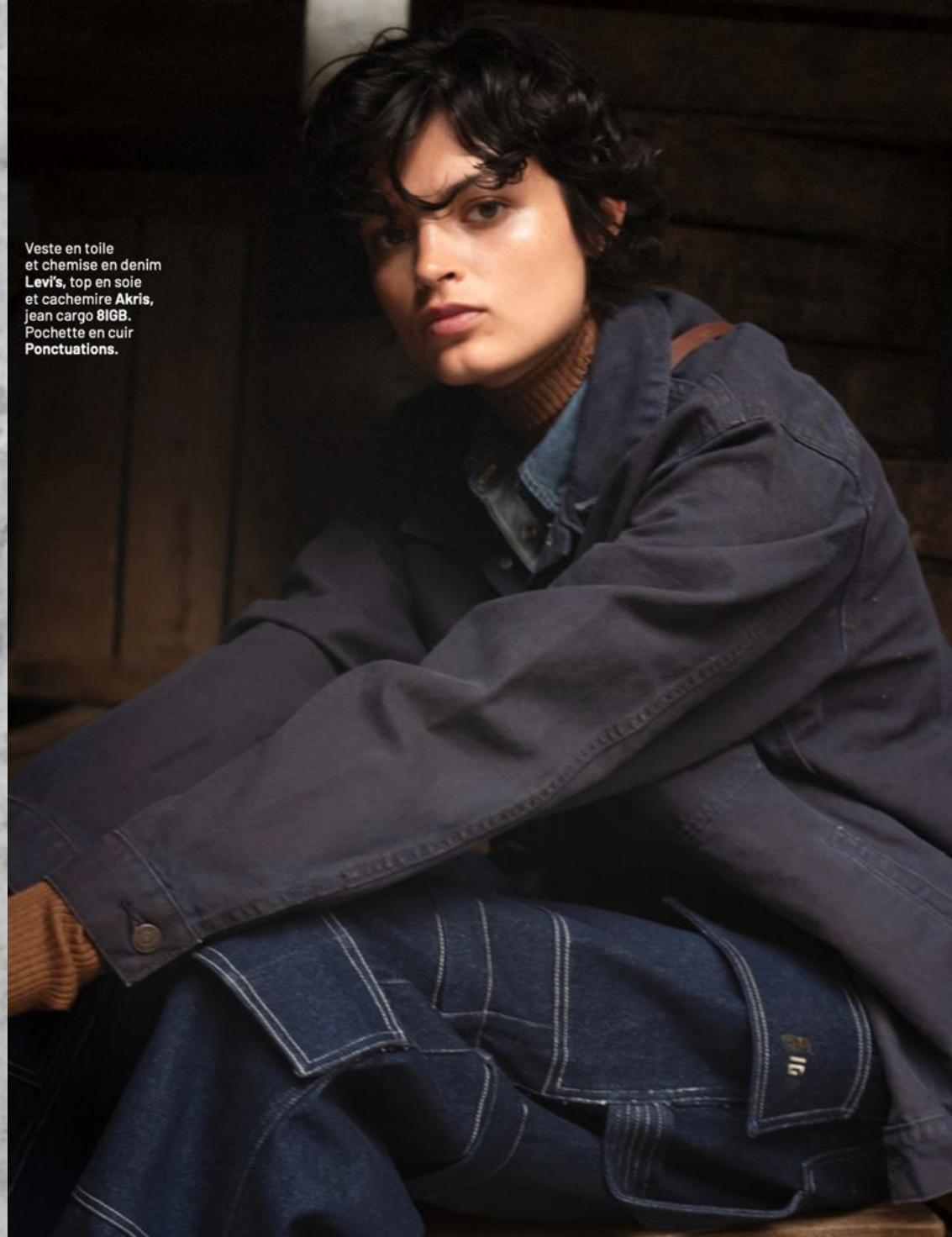
Veste en toile et chemise en denim Levi's , top en soie et cachemire Akris , jean cargo 8IGB . Pochette en cuir Ponctuations .