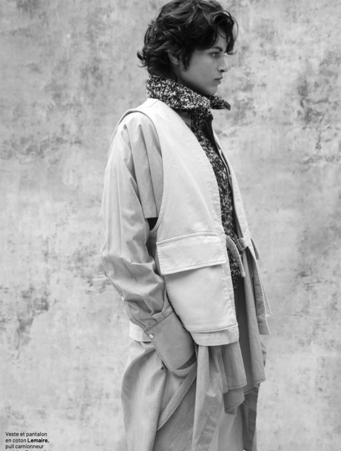
Veste et pantalon en coton Lemaire , pull camionneur en laine Comptoir