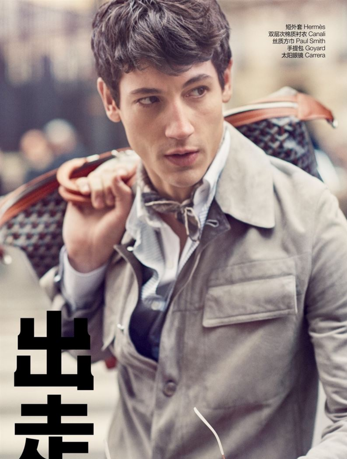
短外套 Hermès 双层次棉质衬衣 Canali 丝质方巾 Paul Smith 手提包 Goyard 太阳眼镜 Carrera