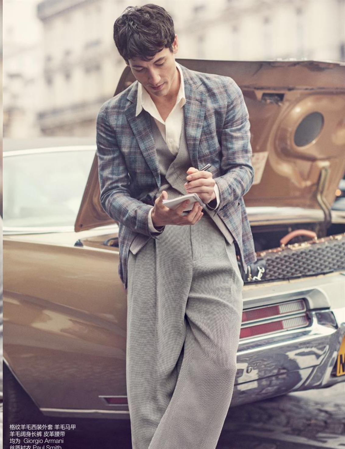
格纹羊毛西装外套 羊毛马甲 羊毛阔身长裤 皮革腰带 均为 Giorgio Armani 丝质衬衣 Paul Smith