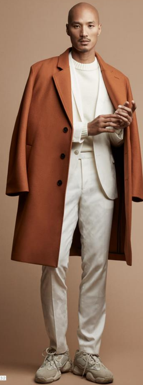
Complet et manteau Hugo; chandail Boss; chaussures Yeezy Adidas Hugo suit and jacket; Boss sweater; Adidas Yeezy sneakers