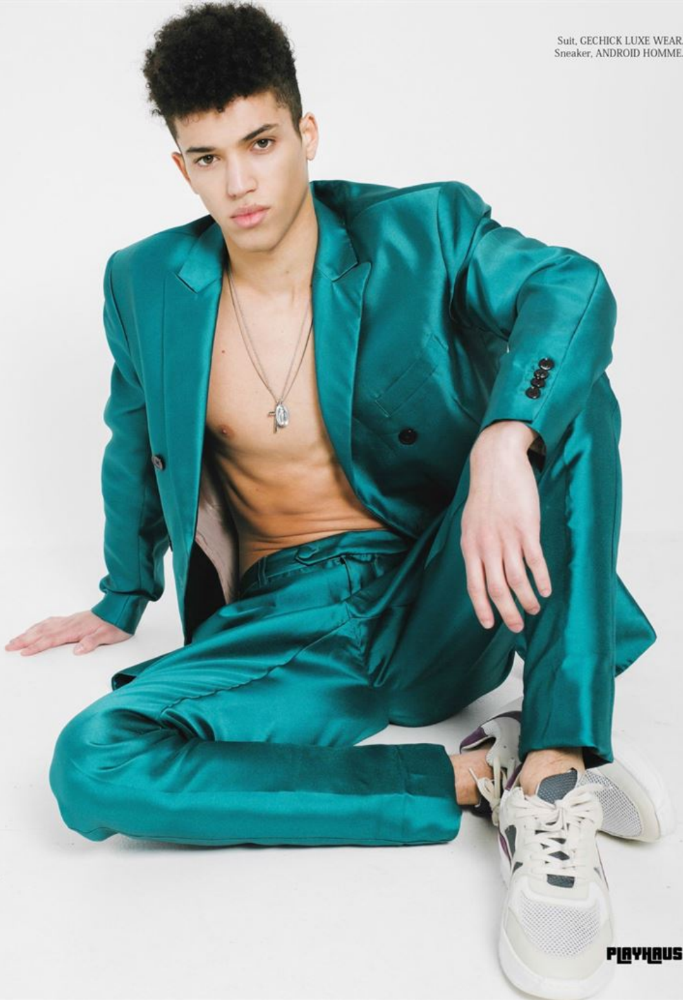
Suit, GECHICK LUXE WEAR. Sneaker, ANDROID HOMME.