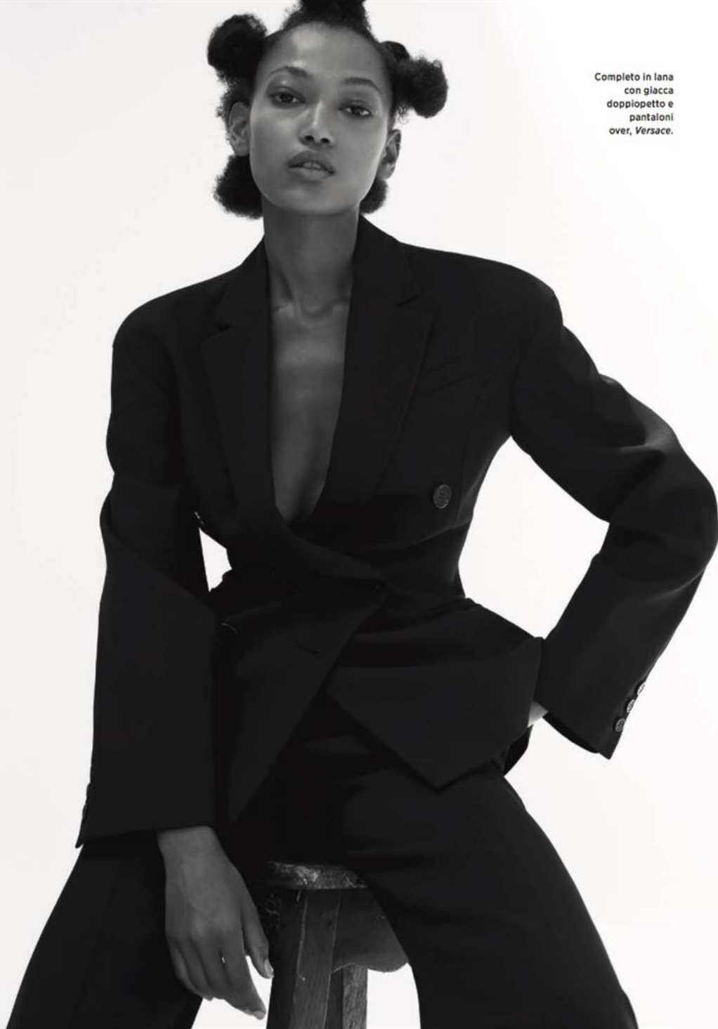
Completo in lana con giacca doppiopetto e pantaloni over, Versace.