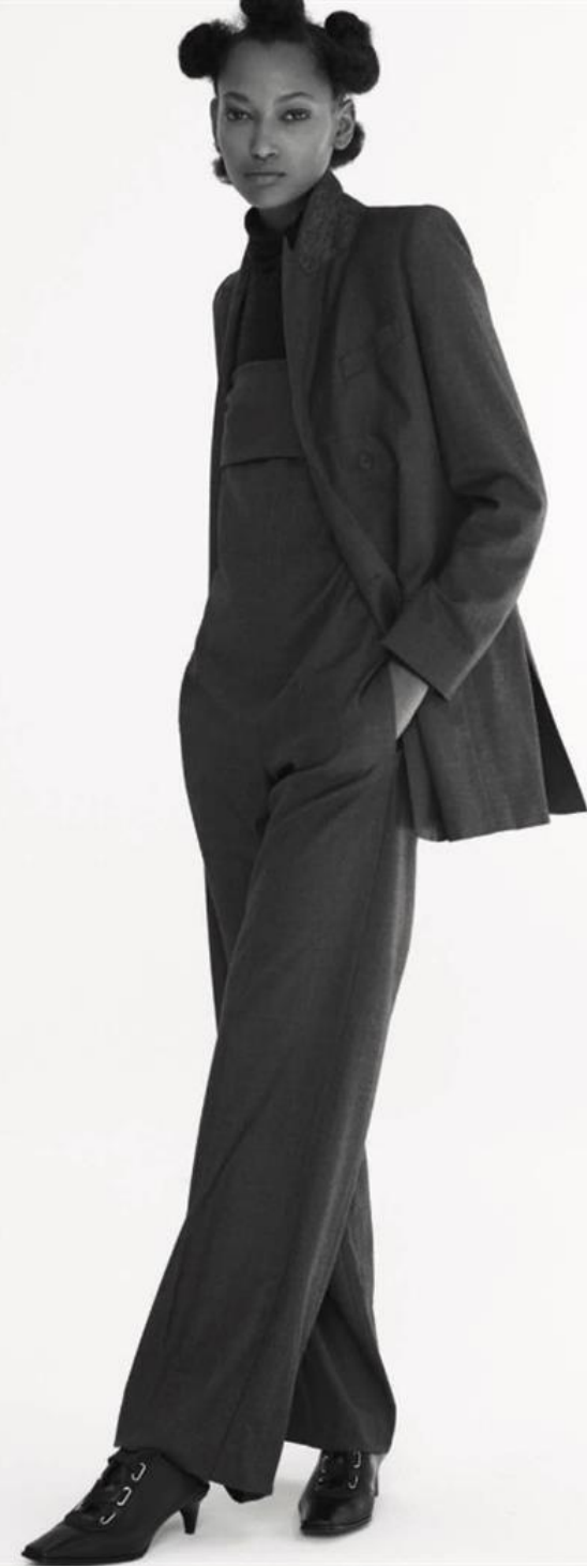
Blazer doppiopetto in lana, tuta bustier coordinata e lupetto di cashmere, Max Mara. Mules di pelle, Versace. Nella pagina accanto. Jumpsuit monomanica in tessuto tecnico stretch con spallina di pizzo, Pinko.